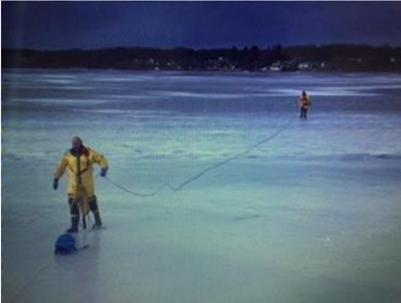
Ice Rescue of Dog in White Lake, MI

Also, take a moment to review rescue some accepted procedures: