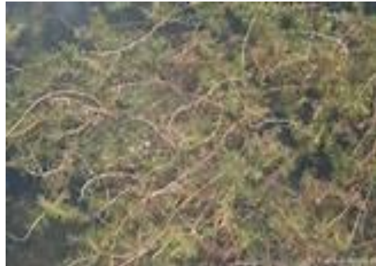
Eurasian Milfoil Invasive Species in Pine Lake.

Our lake limnologist has made recommendations which include containing the invasive aquatic weed Eurasian Milfoil with a management program and to watch for the new invasive Starry Stonewort weed.