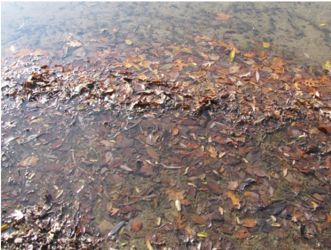
Remove Leaves from the lake edge, or they turn into muck.

All yard waste removed needs to be placed in large lawn paper bags or in garbage cans labeled "Yard Waste Only" for removal by West Bloomfield Township.